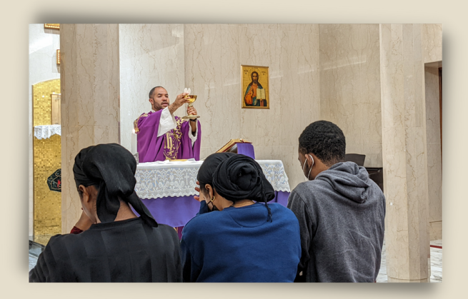
Celebrating Mass at the Franciscan Monastery

Our ministry is growing. We are empowering our students to take ownership of their faith, and they are responding. Continue to pray for and support our efforts to strengthen the Catholic presence at Howard University.