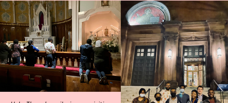
Holy Thursday pilgrimage visiting altars of repose at Immaculate Conception Church (above) and St. Matthew's Cathedral (right).

Exploring/deepening my faith and actively participating in Sunday Mass with this group have helped me have a better relationship with the Lord.